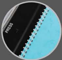
4. Unique design for wire hanging.