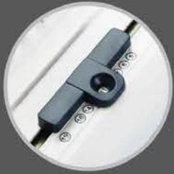
1. Micro-adjust wire closer.