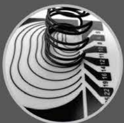
5. Measure gauge for determining the size of wire accurately.