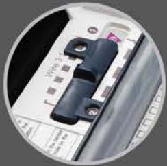
2. 2 in 1 paper slot punching for both comb & wire by easy switch.