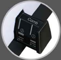
3. Adjustable punch depth.