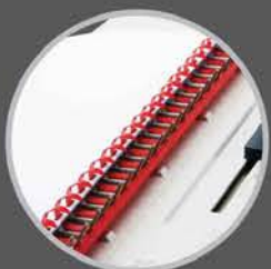
6. Grip for inserting & opening comb.